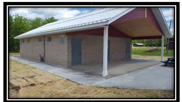
Shower and Bathroom Facility in Firefighters Park near boardwalk and trail