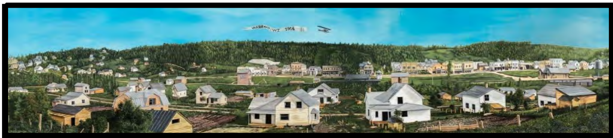
8 ft x 32 ft Mural; Overview of 1916 Wabeno on a Downtown Business