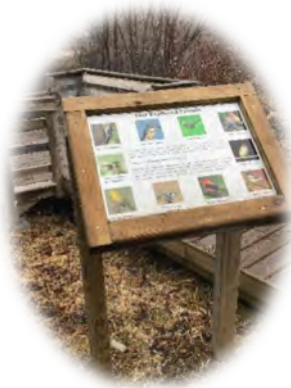
Boardwalk and Nature Trail